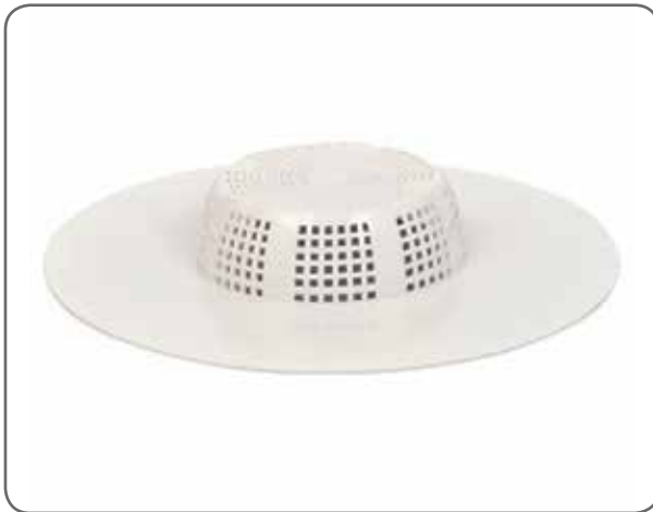
A hair trap

Baths and bathroom sinks tend to get blocked with a mixture of soap, toothpaste and hair. To avoid the sink or bath becoming blocked, buy a hair trap. This sits over the plug hole/drain and stops the hair going down and blocking the waste pipe. These are cheap – they usually cost £2-3 from any hardware shop and some pet supply shops. Empty the trap into the bin when it starts to get blocked up with hair.