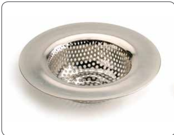
A sink strainer