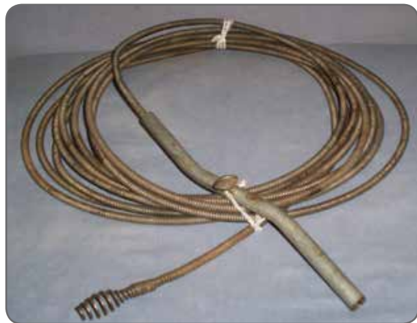
A typical plumber's snake

You can try to break up the obstruction using a piece of wire (from a wire coat hanger), or you can buy a plumber's snake. This is a coiled metal wire with a handle on one end and a metal head on the other. You put the head end down the toilet and turn the handle to break up the blockage. Make sure you buy one that is suitable for use in a toilet, and take care not to scratch the bottom of the toilet. Toilet snakes cost £10-15 from hardware shops.