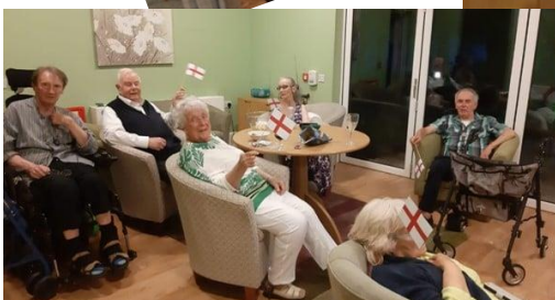
World cup fever