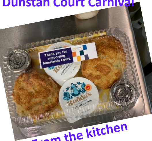
From the kitchen