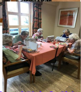
National Fish & Chip Day