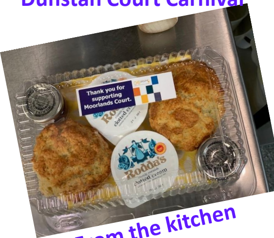
From the kitchen