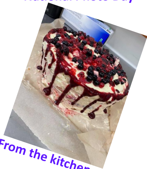
From the kitchen