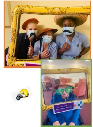
National Photo Day