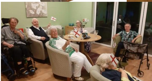
World cup fever