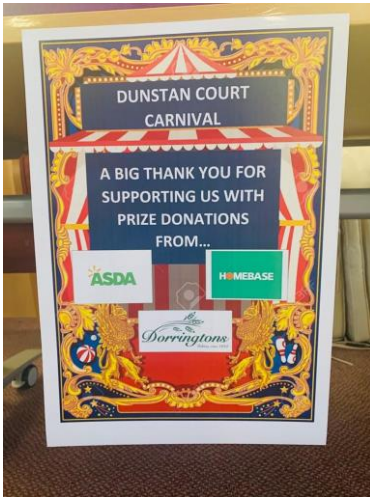
Dunstan Court Carnival