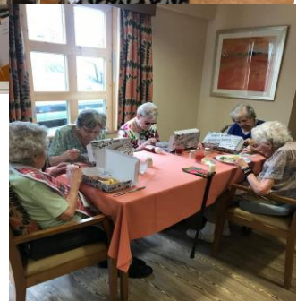
National Fish & Chip Day